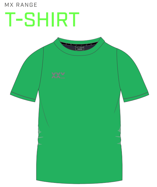
FIT: REGULAR AND FITTED COLOURS: MADE-TO-ORDER MATERIAL: MICRODOT, 100% POLYESTER