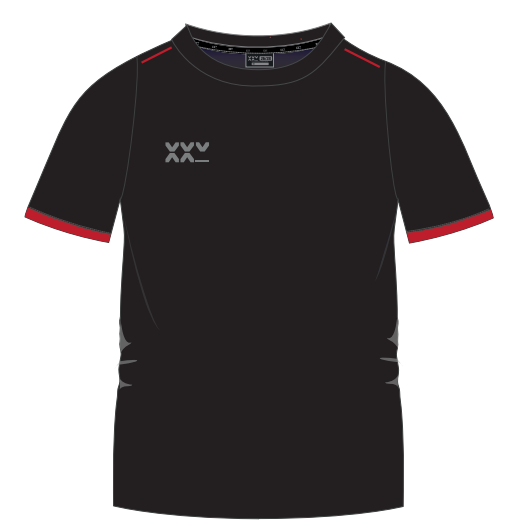
FIT: REGULAR AND FITTED COLOURS: MADE-TO-ORDER MATERIAL: MICRODOT, 100% POLYESTER