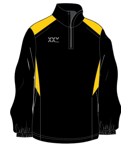
FIT: REGULAR AND FITTED COLOURS: MADE-TO-ORDER MATERIAL: FRENCH RIB, 100% POLYESTER